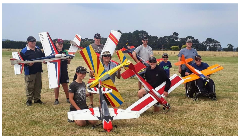
Pilots and models from RC Clubman aerobatics