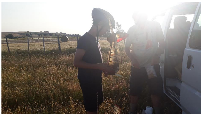
Preping for Aggy