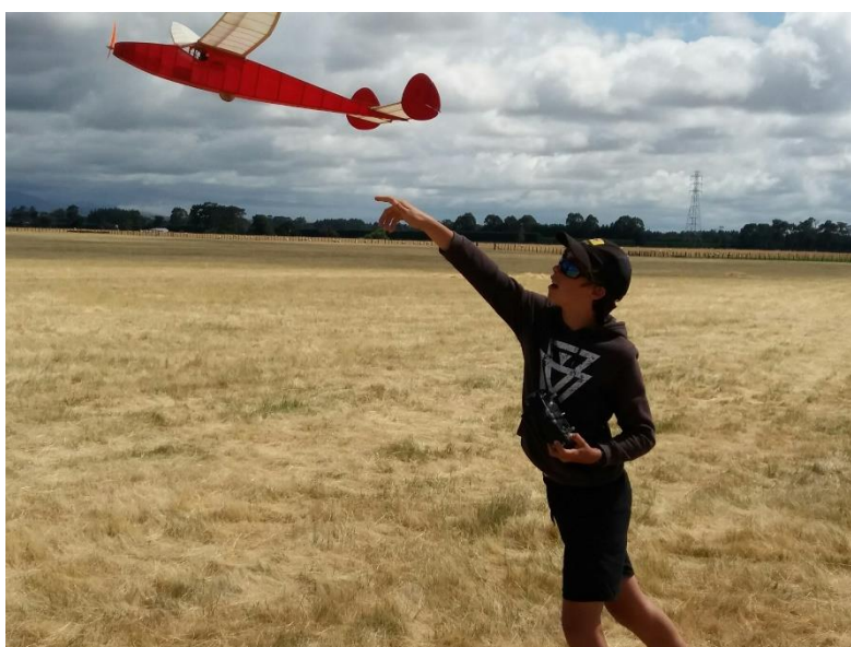
Launching the Ascender in Vintage E Rubber